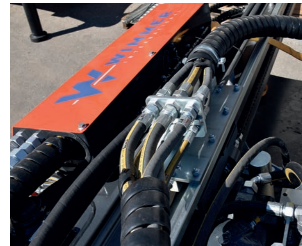
Functional hose guide