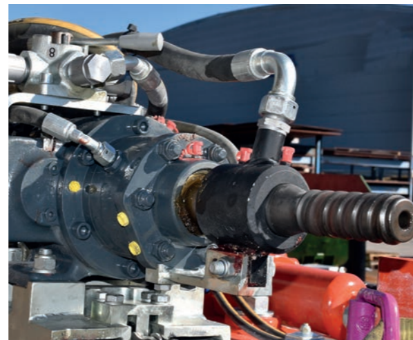
Eurodrill WHD 1002 hammer