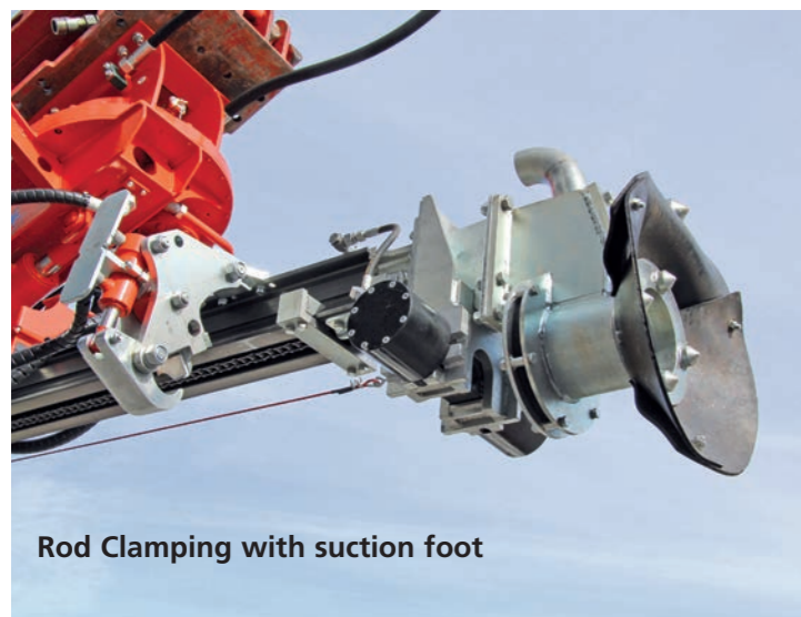
Rod Clamping with suction foot