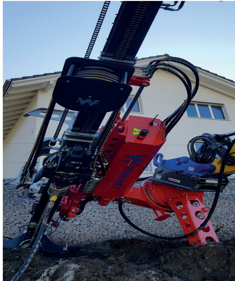
Drilling data evaluation with the Wimmer Cockpit