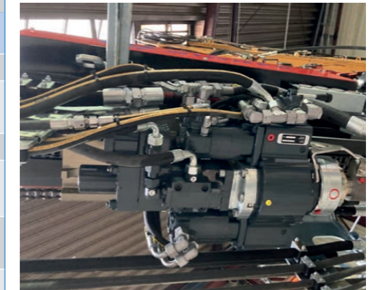
Eurodrill RH 4 X